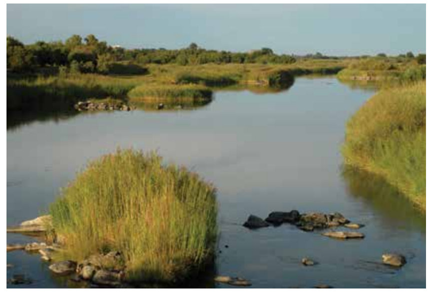
Northern Cape Province, Orange River to Upington

South Africa now has 1,085 water treatment systems supplying potable water to the nation. These plants process raw water from the nearest river, producing potable water that is then reticulated into a complex set of pipes, reservoirs and pumping stations. All of these are artefacts from our historic past, so each is embedded in a specific set of circumstances. Some are world class, such as those operated by Rand Water Board and other major water boards like Umgeni Water, but in reality there is a wide range from very small rural systems to extremely large urban systems. Of these 1,085 there are 250 reported to be operating "below standard" according to official reports.